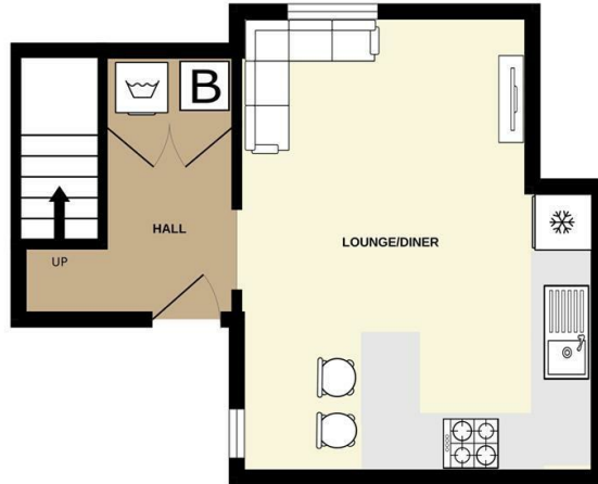
GROUND FLOOR 289 sq.ft. (26.9 sq.m.) approx.